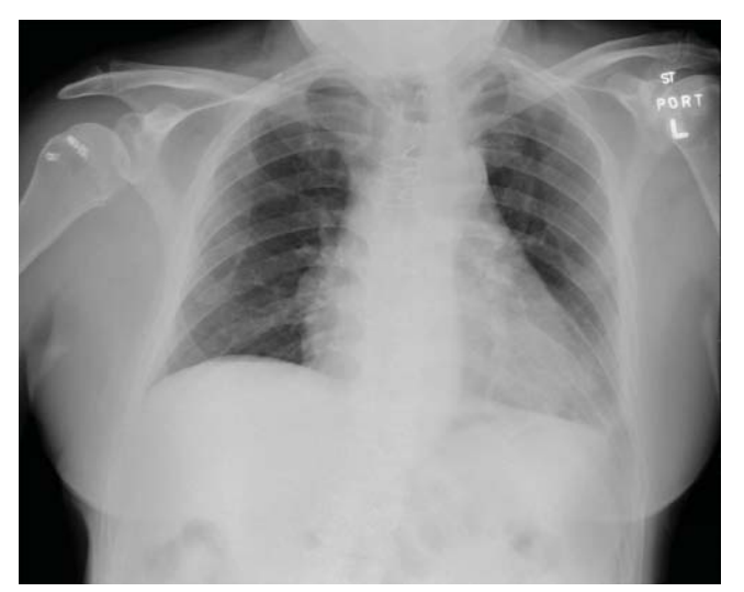
FIGURE 2. A follow-up chest radiograph confirmed resolution of the elevated right hemidiaphragm.

72-YEAR-OLD MAN underwent elective ambulatory A arthroscopic repair of the right shoulder rotator cuff. To manage postoperative pain, a supraclavicular catheter was placed for brachial plexus block, and he was sent home with a ropivacaine infusion pump.