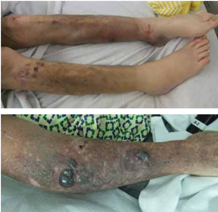
FIGURE 3. Purpuric macules and plaques on forearm and legs of a 59-year-old man on dialysis for the past 2 years.

The recommended dietary allowance for vitamin C is much higher than the amount needed to prevent scurvy