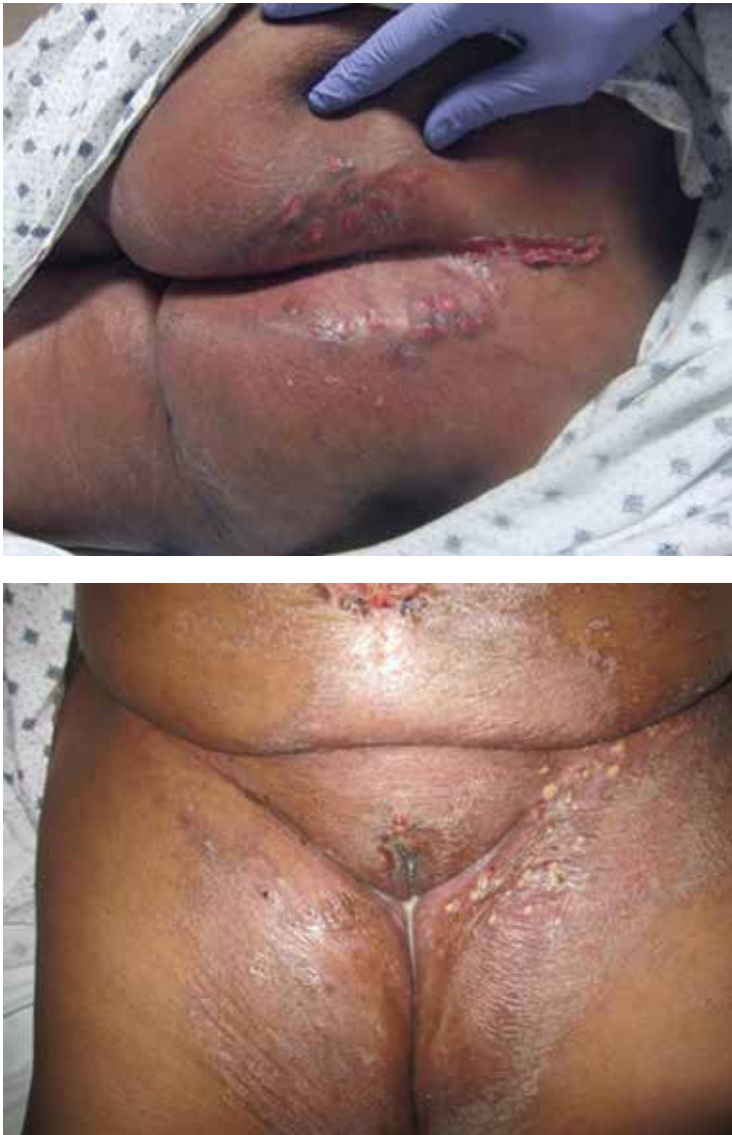
FIGURE 6. A 62-year-old woman with a long history of skin ulcerations with polymicrobial infections presented with generalized xerosis and red painful erosions in intertriginous areas, the result of vitamin B 6 deficiency.

erosions in intertriginous areas ( Figure 6 ).