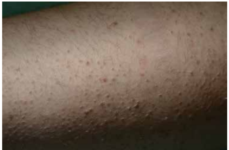
FIGURE 5. Diffuse hyperkeratotic follicular papules on a 14-year-old girl on total parenteral nutrition for the past 3 years.