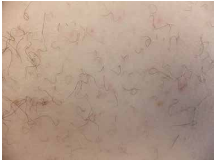
FIGURE 4. Corkscrew hairs on the abdomen of a 50-year-old man with a history of type 1 diabetes mellitus and kidney and pancreas transplant.

Evidence is mounting to suggest phrynoderma is a cutaneous manifestation of diverse nutritional deficiencies, not just vitamin A. For example, some children with phrynoderma have normal levels of vitamin A, 26 and a trial showed that patients with phrynoderma benefited from intramuscular injections of either vitamin A or vitamin B complex, particularly when also treated with topical keratolytics. 27 Thus, patients who present with the typical lesions of phrynoderma should be screened for nutritional deficiencies beyond vitamin A.