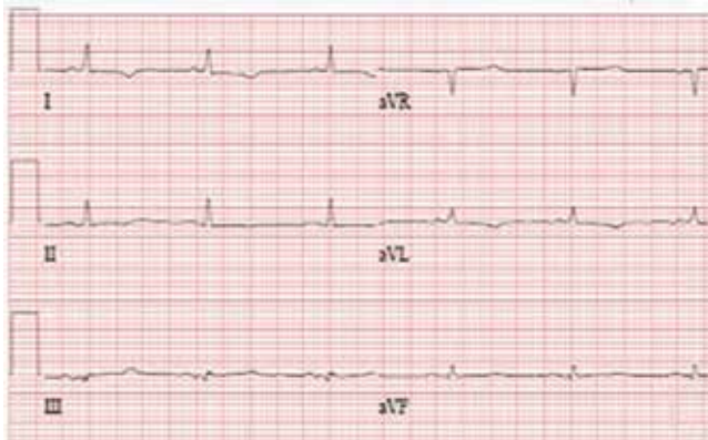
FIGURE 4. After reimplantation of the cardioverter-defibrillator, the electrocardiogram was normal.