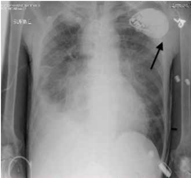
FIGURE 3. Chest radiography showed that the generator had rotated 90 degrees and the lead had completely wrapped around the generator (arrow).