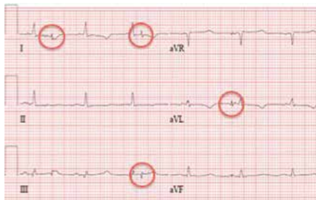
FIGURE 2. Electrocardiography 6 weeks after the device was placed showed normal sinus rhythm, but with inappropriate device discharges (circles).

Electrocardiography at the time of presentation showed a normal sinus rhythm with inappropriate ICD discharges ( FIGURE 2 ). This finding prompted chest radiography, which showed that the ICD had rotated 90 degrees from its original position, and that the lead had completely wrapped around the generator and thus was no longer correctly positioned ( FIGURE 3 ). The patient admitted to frequently rubbing (ie, twiddling) the area, which led to twisting and dislocation of the device, a complication known as twiddler syndrome.