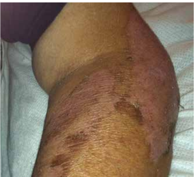
FIGURE 1. The patient had an erythematous, scaly rash on his face and a nonhealing sunburn on the left forearm.

M ANAGING A PATIENT WITH chronic alcohol abuse who is beginning to withdraw is a situation in which to expect the unexpected.