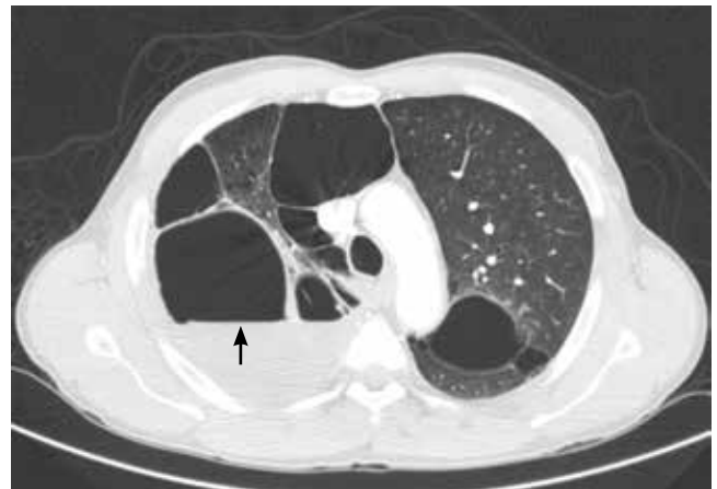
FIGURE 2. Computed tomography of the chest (lung window) showed bilateral bullous disease and a right-sided air-fluid level (arrow).

Pulmonary function testing demonstrated moderate obstruction, with the following values: