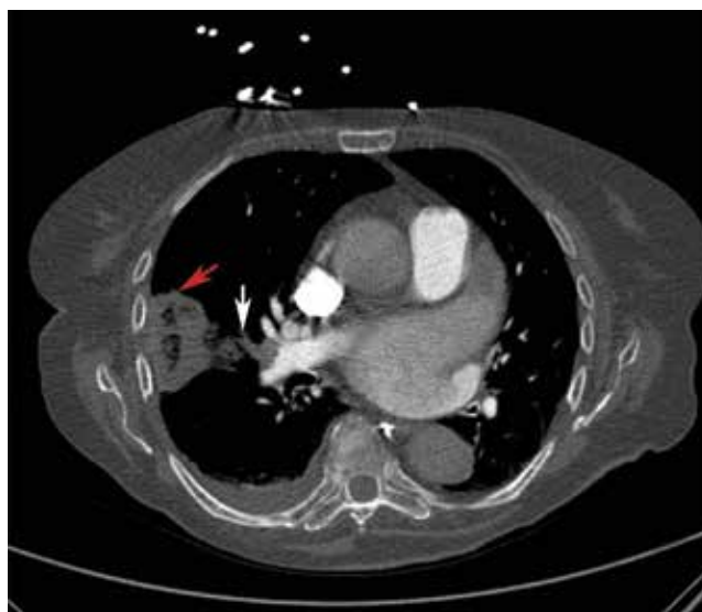
FIGURE 2. Computed tomography of the chest showed acute thromboembolism in the right interlobar artery (white arrow) and a wedge-shaped consolidation in the right-middle lobe (red arrow), consistent with pulmonary infarction.

A N 82-YEAR-OLD WOMAN was admitted to the hospital with dyspnea and chest discomfort over the past 24 hours. She was known to have paroxysmal atrial fibrillation and was taking warfarin, but that had been stopped 2 weeks earlier because of an acute ischemic stroke.