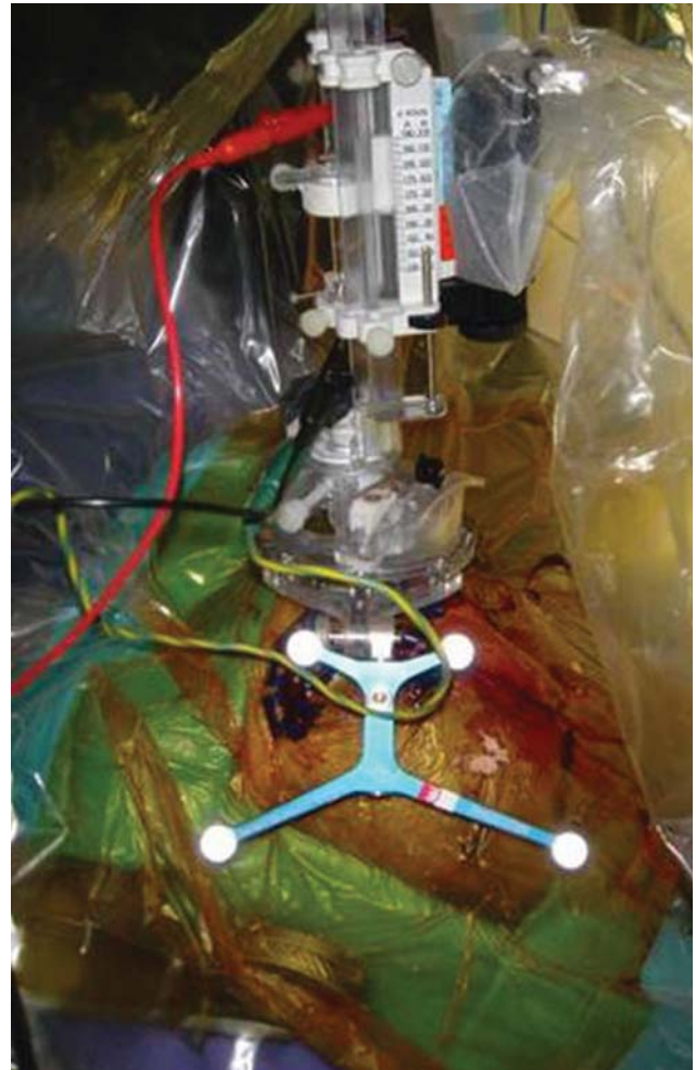
FIGURE 3. Surgeon's view of the frameless device, placed over the head approximately at the level of the coronal suture. The occipital area is in the bottom of the figure. When a frameless system is used, a lighter-weight structure is affixed to the head.

Physiologic verification of anatomic targets identified by imaging can be accomplished with microelectrode recording (MER). This technique involves placing fine, high-impedance electrodes through the target area, so that anatomic structures can be recognized by characteristic electrical activity of individual neurons or groups of neurons. The locations of the structures are identified