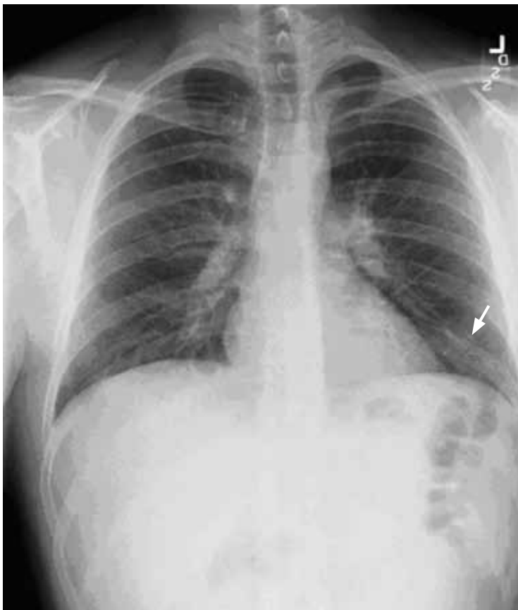
FIGURE 1. The patient's chest radiograph shows small atelectatic changes in the left lung base (arrow).