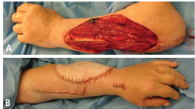
FIGURE 2. (A) Complex defect of the forearm after wide excision of an intermediate-grade soft-tissue sarcoma (spindle-cell sarcoma) with excision of the extensor digiti communis tendon. (B) Reconstruction was performed with tendon transfer from the extensor carpi radialis to the extensor digiti communis to fingers 2–5, and the wound was closed with an anterolateral thigh free flap.

Musculoskeletal sarcomas of the arm and hand present challenges because of these sites' unique anatomy. The arm and hand contain little soft tissue, and compartments are narrow. Amputation rates are higher for upper-extremity sarcomas, mostly because adequate margins are more difficult to obtain. Moreover, the sacrifice of important structures after wide resection can directly affect hand function. 15 Exposure of nerves, tendons, blood vessels, and bone will often require free tissue transfer. In that situation, immediate coverage is recommended, with free tissue transfer being the most available choice. A pedicled radial forearm flap can be used for smaller defects. For larger defects, the anterolateral thigh flap is indicated (Figure 2). If bone is resected, a vascularized fibula free flap is used. In the case of sarcoma involving a digit, ray amputation is often required.