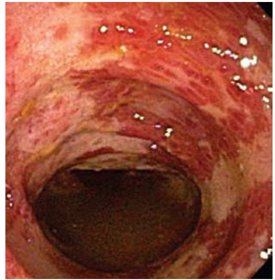
FIGURE 3. Severely active ischemic colitis with extensive ulceration and submucosal hemorrhage distributed segmentally in the distal transverse colon and descending colon.

Drugs should always be considered as possible culprits