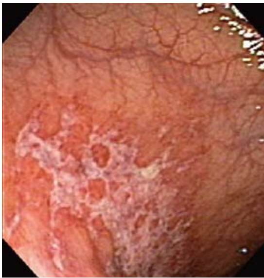
FIGURE 2. Mildly active ischemic colitis with a large superficial ulcer in the watershed area of the splenic flexure.