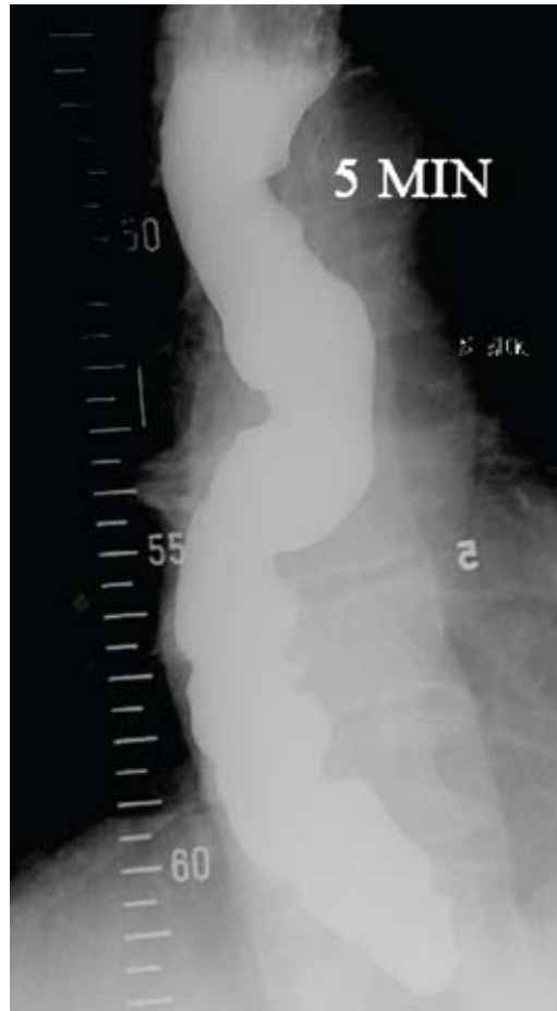
FIGURE 1. Timed barium swallow in a patient with achalasia. The patient consumed 140 mL of low-density barium. There is no emptying of barium between the 1-minute and 5-minute films.

Oropharyngeal dysphagia is best evaluated by a speech and language pathologist