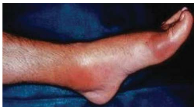
FIGURE 2. Swollen, erythematous ankle and first metatarsophalangeal joints during an acute attack of gout.

Certain medications have been associated with hyperuricemia, including cyclosporine and thiazide diuretics. 9 If a patient has been taking one of these medications, gout should be considered in the differential diagnosis if