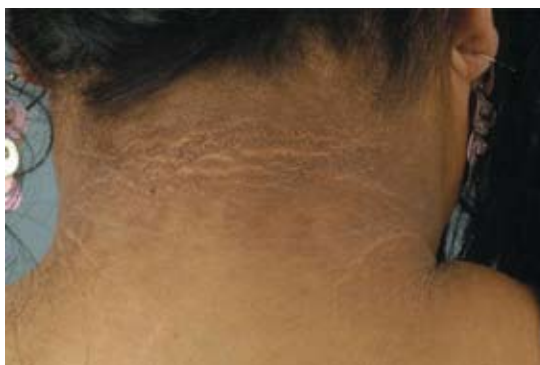
FIGURE 3. The velvety, hyperpigmented plaques of acanthosis nigricans occur usually in body folds and are thought to be related to high levels of circulating insulin.

Acanthosis nigricans (FIGURE 3) presents as hyperpigmented, velvety plaques in body folds. The dark color is due to thickening of keratin-containing superficial epithelium. 31 It