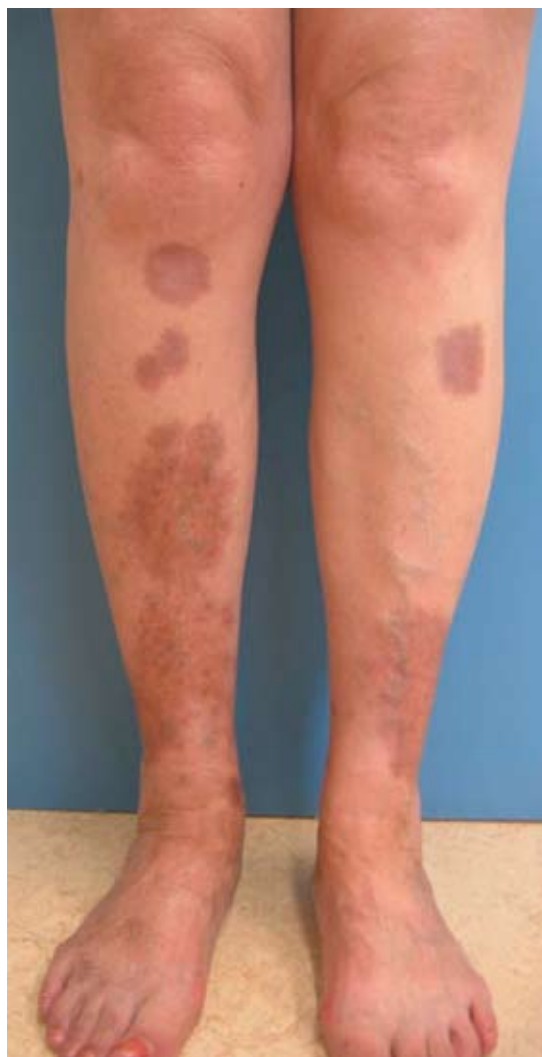
FIGURE 1. General appearance of necrobiosis lipoidica, consisting of nonscaling plaques in the pretibial region of the legs.

The association between diabetes and lichen planus (FIGURE 2), especially oral lichen planus,