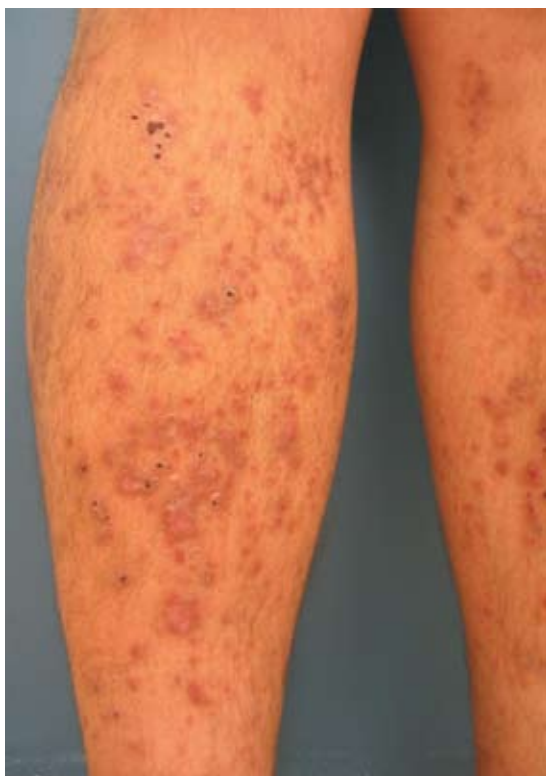
FIGURE 2. Lichen ruber planus typically presents on the skin as flat, polygonal, erythematous lesions of the lower legs, and also on the wrists and the dorsal areas of the feet.

In diabetic patients with yellow nails, the discoloration is most evident on the distal hallux nail