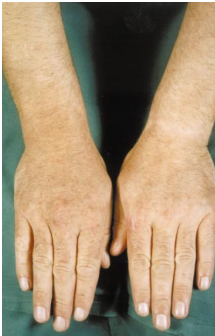
FIGURE 1. Skin pigmentation on the hands and forearms of a patient with hereditary hemochromatosis.