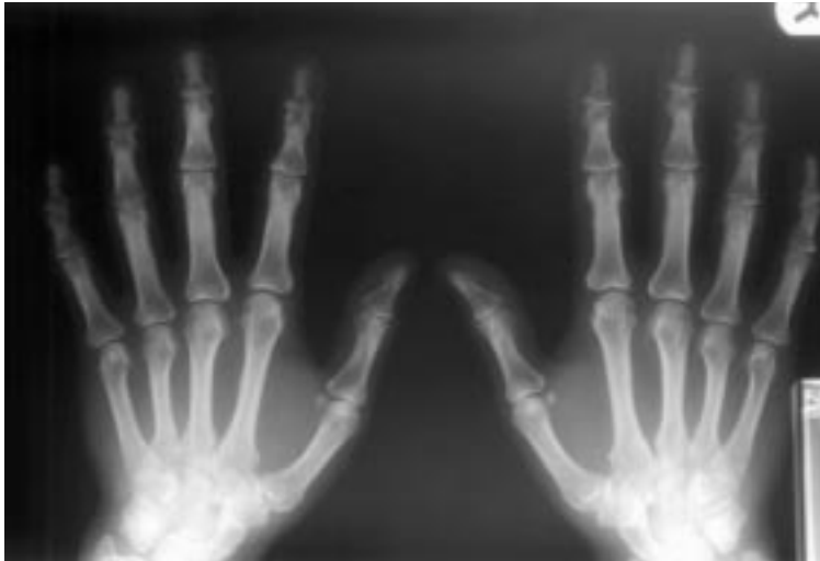
FIGURE 2. Top , this patient with hemochromatosis arthritis has symmetric arthropathy of second and third metacarpophalangeal joints with loss of cartilage and the formation of marginal beaked osteophytes (arrows). Bottom , in contrast, in this patient with osteoarthritis, mild osteoarthritis is visible in the distal interphalangeal joints of all fingers, especially the right second and third. There is minimal involvement of the right proximal interphalangeal joints.