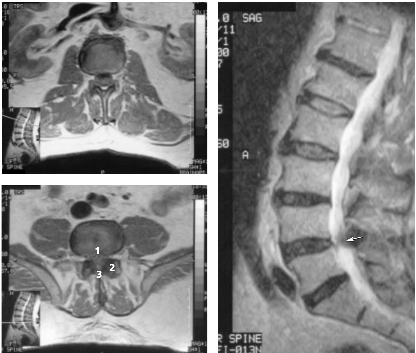
FIGURE 1. Magnetic resonance imaging (MRI) scans in a 75-year-old man. Top left , minimal degenerative changes at the L1-L2 level. Bottom left , severe lumbar canal stenosis at the L4-L5 level due to (1) disc degeneration, (2) facet hypertrophy, and (3) ligamentum flavum hypertrophy. Right , lateral view. Note the stenosis at L4-L5 (arrow).

mobility, with or without spinal canal stenosis. Extension is usually more limited than flexion. 10,11