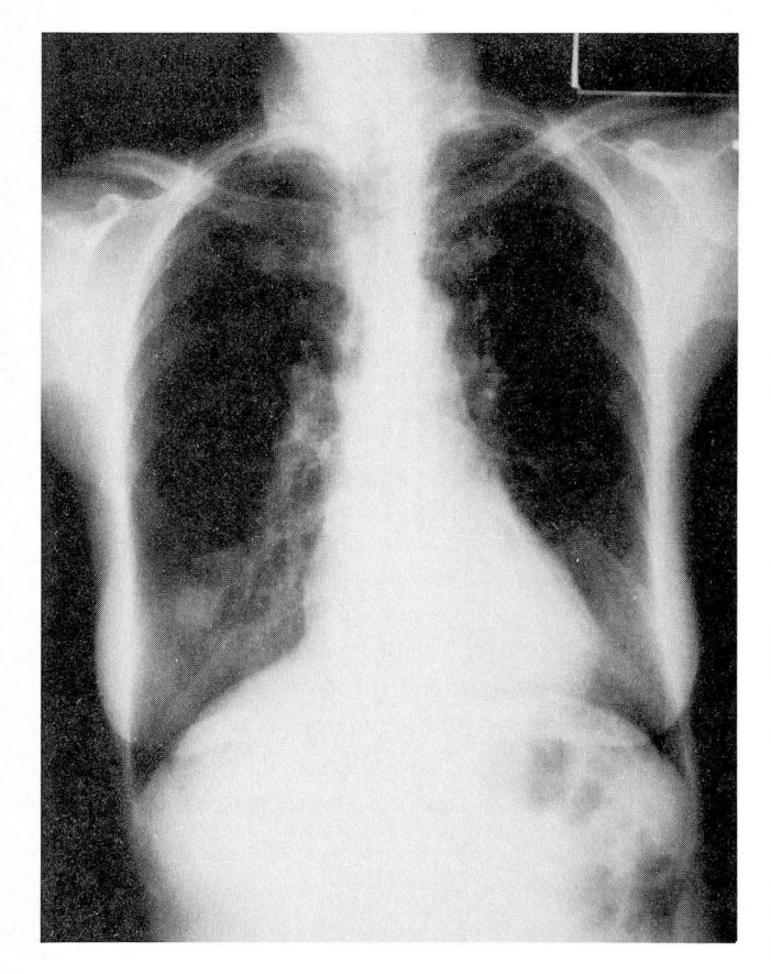
FIGURE 1. Chest radiograph demonstrating a solitary coin lesion in the lower lobe of the right lung.

Physical examination and laboratory data on admission were unremarkable. Pulmonary function tests demonstrated a moderate obstructive defect. A chest radiograph ( Figure 1 ) and computerized tomographic scan showed a noncalcified nodule about 2 cm in diameter in the posterior aspect of the right lower lobe. No evidence of mediastinal involvement was demonstrated. The patient underwent a right thoracotomy and wedge resection of the nodule. After an uncomplicated postoperative course, she was discharged.