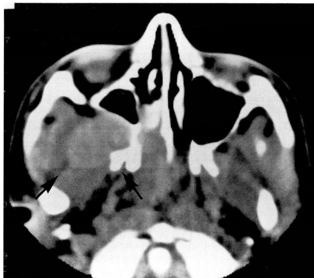
FIGURE 1. Computed tomogram of the nose and paranasal sinuses showing right-sided angiofibroma (on left side of figure). Note mass in right side of nose, nasopharynx, and pterygopalatine fossa, as well as anterior bowing of posterior wall of right maxillary sinus and erosion of anterior aspect of pterygoid plates on right.

Fifteen patients were treated for nasopharyngeal angiofibroma between 1977 and 1986 at The Cleveland Clinic Foundation Department of Otolaryngology and Communicative Disorders. Their charts and follow-up contacts were reviewed with respect to type of presentation, duration of symptoms, age at diagnosis, diagnostic and treatment modalities, and complications (Table 2).