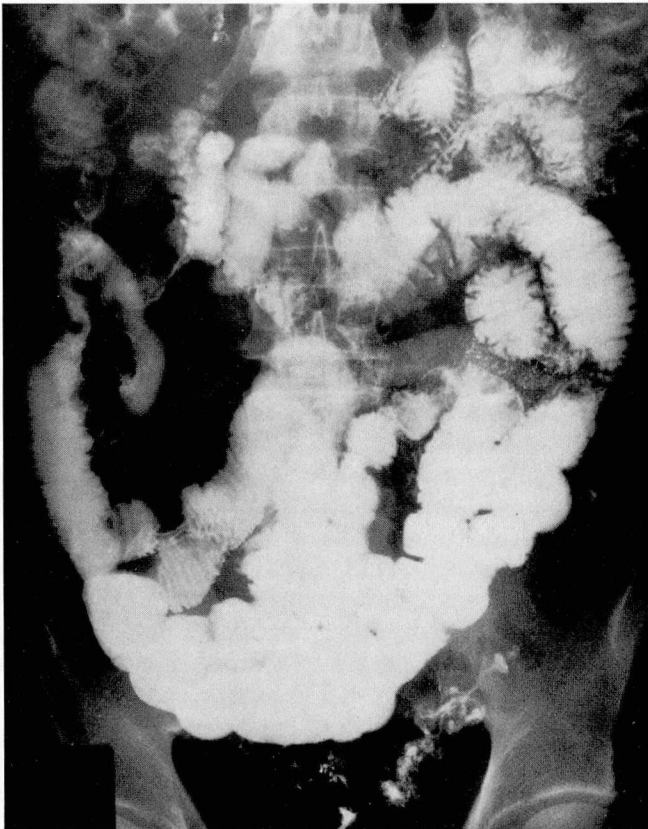
FIG. 2 Case 4. Radiograph from small bowel series showing multiple narrowed, irregular areas of the terminal ileum and mild prestenotic dilatation.