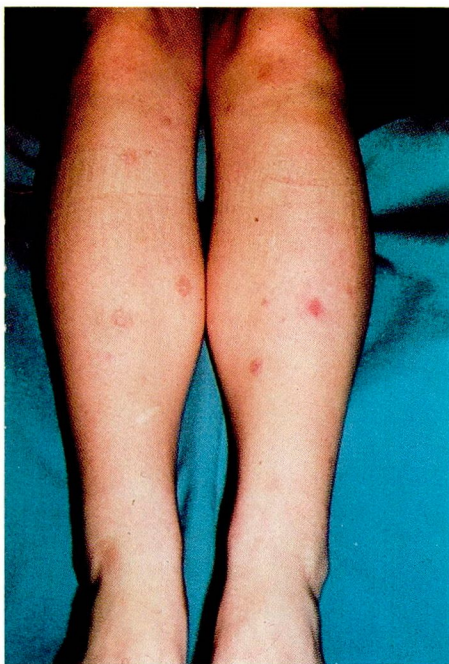
Fig. 1. Typical scarring of EDS, mild (patient).

crusted papules on the nose and chin. Echinomoses were absent and the tongue was not hyperextensible (negative Gorlin's sign). Examination of the patient's mother revealed mild skin stretchability and moderate joint laxity. The patient's 10-year-old brother had several scars on the elbows and knees identical to those seen on the patient (Fig. 3); his skin was mildly hyperextensible and the joints of his hands were moderately lax. Results of physical examination of the father of the patient and a 15-year-old brother were normal.