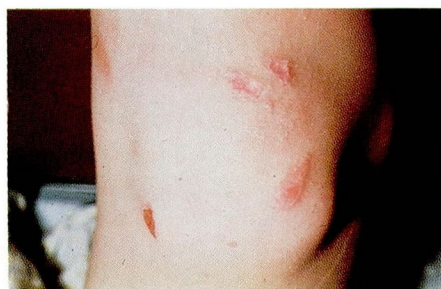
Fig. 3. Typical scarring of EDS, mild (brother of patient).