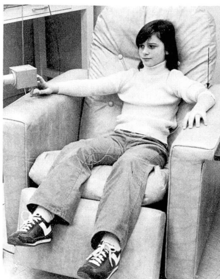
Fig. 1. Healthy 11-year-old child undergoing quantitative cutaneous sensory testing. The young subject is seated comfortably in a large laboratory chair. Electrodes are in place about the left forearm (arrow), and the response lever is being manipulated by the contralateral hand.

Children were studied in a pleasant laboratory situation. When they were comfortably seated in a large chair, the nature of the testing apparatus and their participation in the test was explained to them. With younger children, this was always carried on in the presence of a parent. The situation was comfortable and amusing for the child. Stimuli were not painful. Once cooperation and comfort were ensured, a response lever was placed in easy reach. The cutaneous areas to be studied were cleansed and coated with conductive jelly. Stimulating electrodes were applied closely to the skin area to be tested and held in place with nonocclusive elastic straps ( Fig. 1 ). The stimulating electrodes consisted of 9-