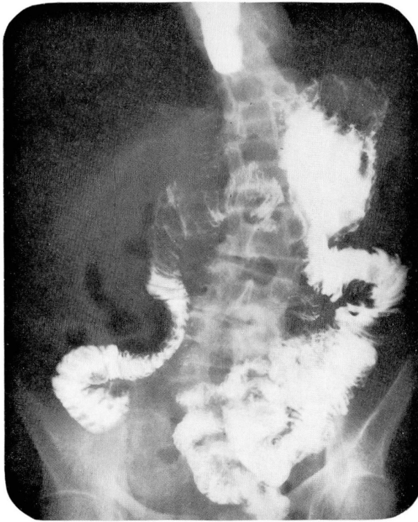
Fig. 1. A roentgenogram from a normal gastrointestinal series obtained in November 1966. This study was made after repeated episodes of vomiting, which were attributed to bile gastritis and psychogenic reaction.

A roentgenogram of the chest, a plain roentgenogram of the abdomen, and an upper gastrointestinal series of roentgenograms showed normal function, as did the intravenous and the retrograde pyelograms. No further episodes of vomiting occurred during the two weeks of observation in the hospital. Upon discharge from the hospital he was advised to follow a diet for dumping syndrome and to take vitamins. He was reexamined periodically, and by November 1, 1966, had experienced five episodes of persistent vomiting. At no time was he observed during one of these "spells." Bile gastritis and psychogenic reactions were considered to be contributory to the symptoms. An upper gastrointestinal roentgenogram in November 1966 revealed a normal gastrectomy. The gastric remnant, stoma, and both loops appeared unremarkable ( Fig. 1 ).