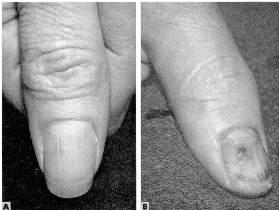
Fig. 2. A, the small, round area of discoloration beneath the woman's thumbnail presents the typical appearance of a glomus tumor. B, after careful complete avulsion of the nail, the extent of the lesion is obvious and total excision of the tumor is readily accomplished.

the tumor area, or with changes in temperature. Rarely the attacks of pain arise spontaneously.