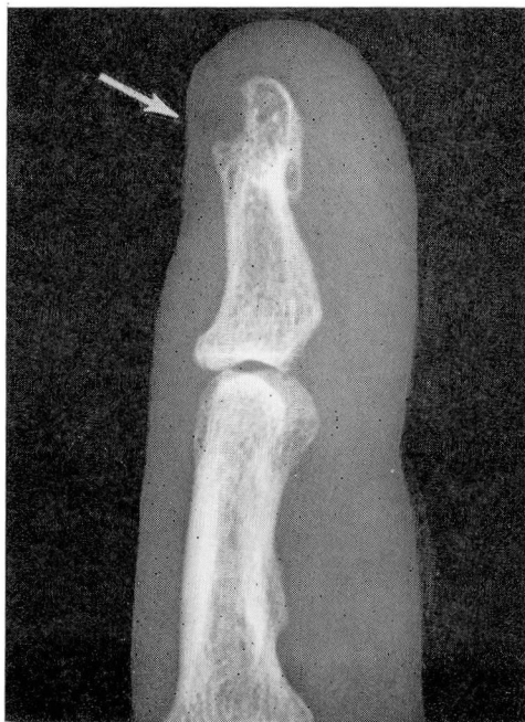
Fig. 4. A roentgenogram of the lateral view of the distal phalanx, index finger. The arrow points to a region of bone erosion, in the tuft of the distal phalanx, produced by pressure of a subungual glomus tumor.