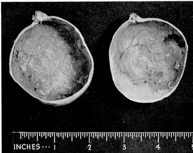
FIG. 2. Case 3. The abscess capsule after fixation.

Pus culture revealed Streptococcus salivarius . For ten days the patient was given intramuscularly 15,000 units of penicillin every three hours, and oral sulfadiazine 1 Gm. four times daily. The first three days the scalp over the implant was tapped daily, a small amount of bloody fluid removed, and 15,000 units of penicillin instilled beneath the scalp. Thereafter no fluid collected, temperature was normal, convalescence was uneventful, and the patient was discharged from the hospital March 4 (fig. 3). Patient was readmitted to the hospital March 12 with a temperature of 102 F. and symptoms of meningitis. Spinal fluid pressure was over 700 mm. of water; fluid contained 800 polymorphonuclear cells; culture was sterile. Patient was treated with daily spinal puncture, intrathecal and intramuscular penicillin and sulfadiazine. He improved for a time but on March 24 became irrational. A needle, introduced through the scalp and through one of the tantalum plate perforations into the right frontal lobe, encountered a large abscess beneath the cortex. Seventy-five cubic centimeters of thick pus was aspirated; culture again revealed Streptococcus salivarius .