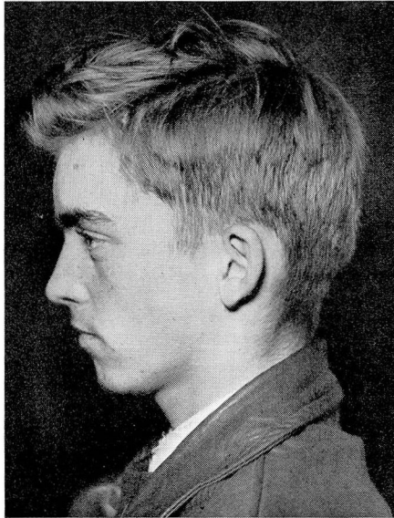
FIG. 5. Case 4. Cosmetic result five and one half months postoperative.

Comment: This is the most significant case in this series. Osteomyelitis of the frontal bone secondary to sinusitis carries a very high morbidity when treated by the usual method of removing the infected bone and leaving the scalp widely open. The result in this case was so gratifying that this method certainly deserves further trial. Even in case continuation of the infection should necessitate subsequent removal of the implant the patient will have lost nothing. The presence of the implant controls the abnormal pulsation of the uncovered brain and this splinting of the wound aids its healing.